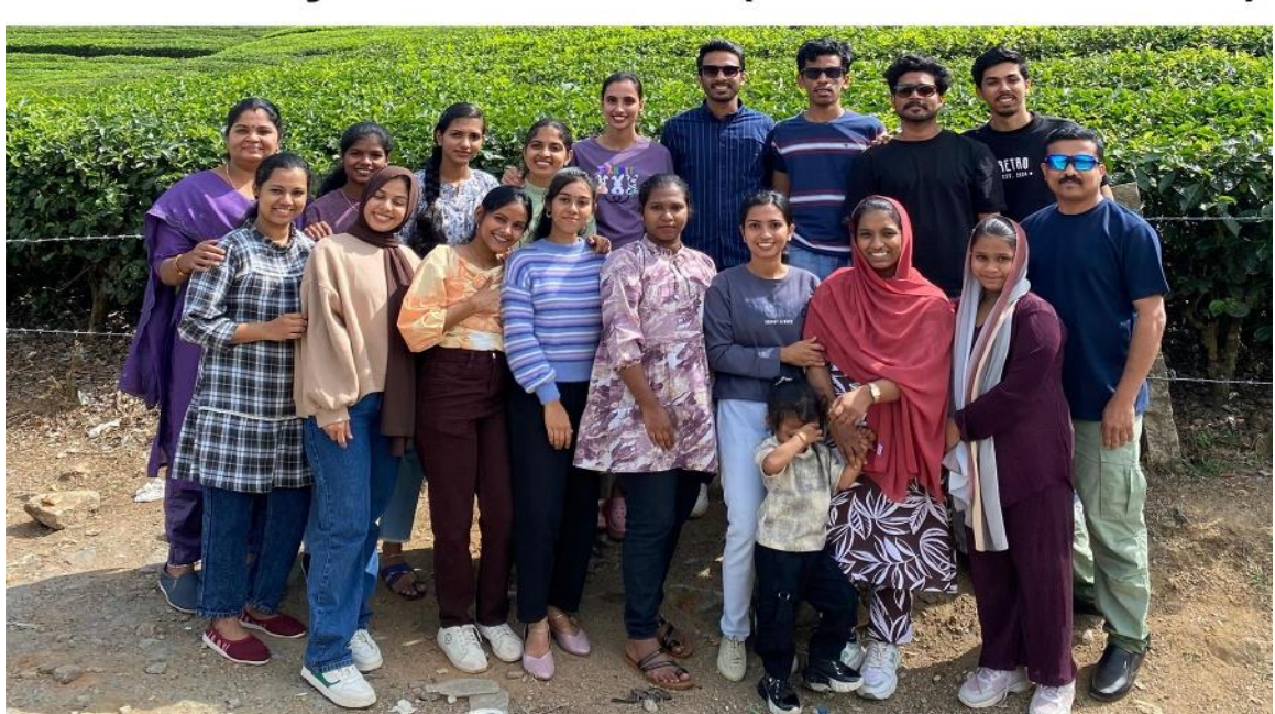
M.Com Study Tour: Mankulam (29/01/25 to 31/01/25)