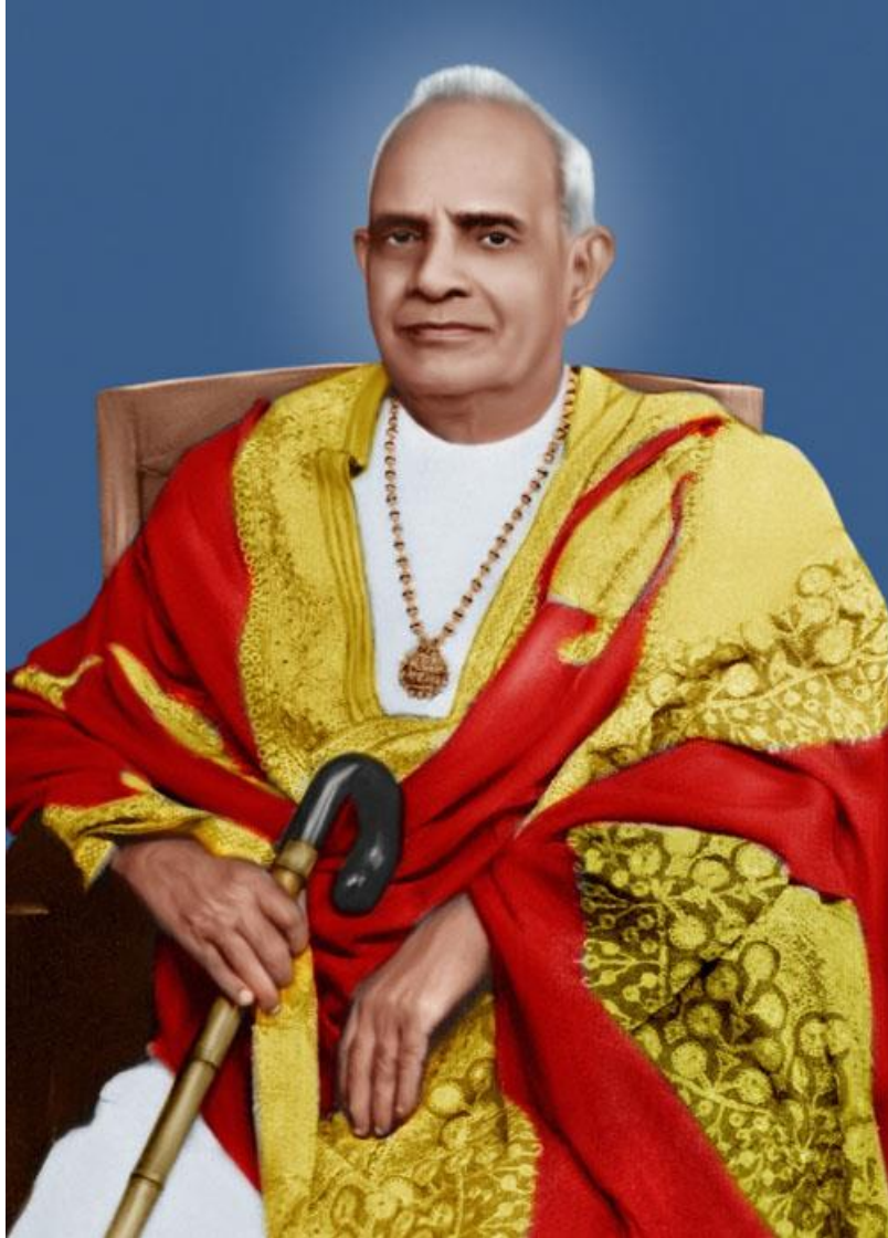
PADMABHOOSHAN BHARATA KESARI MANNATHU PADMANABHAN (1878-1970)